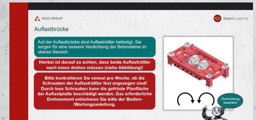
Online HESS E-Learning Videos, interactive modules, webinars, and digital resources