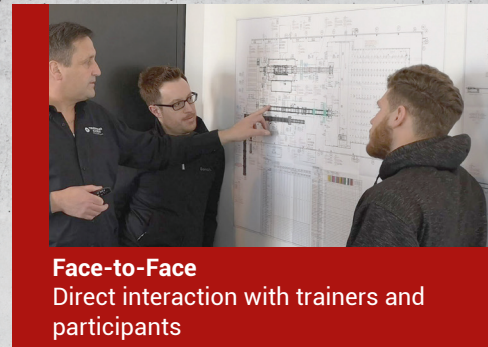
Face-to-Face Direct interaction with trainers and participants