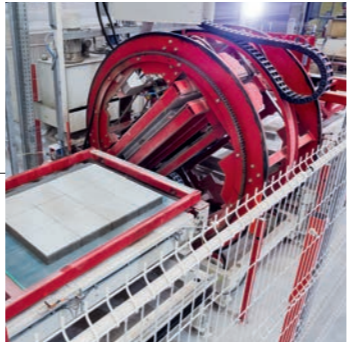
48 Drum turning device