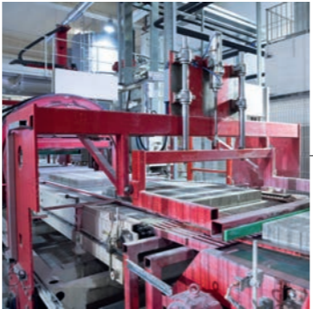
48 Layer pusher (1-6)