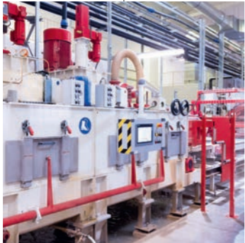
12 Calibrating machine