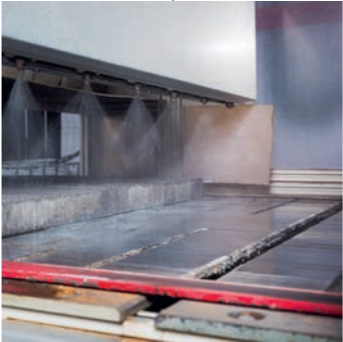
48 Special conveyor for layer-wise transport (self-cleaning)