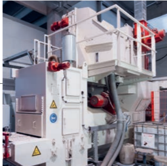
24 Shotblasting machine