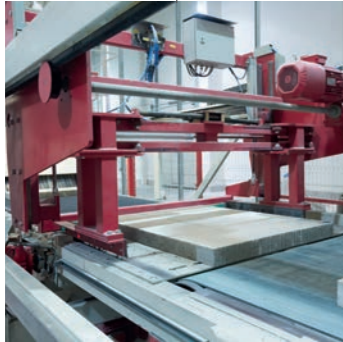
48 Layer pusher (1–3)