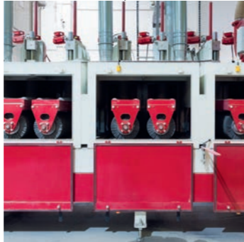
26 Curling machine